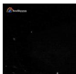
Without white light